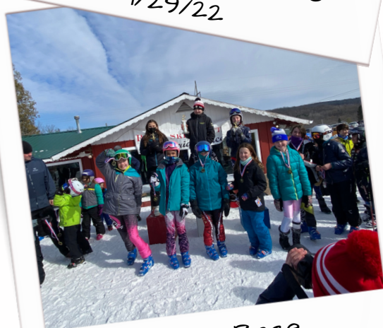
Robin's Race 2/20/22