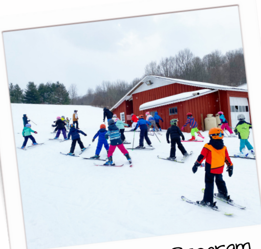
Little Racers Program 1/23/22