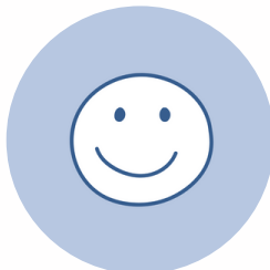
OPEN POSITION BOARD MEMBER