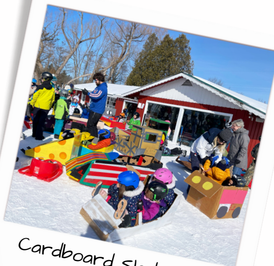
Cardboard Sled Race 1/29/22