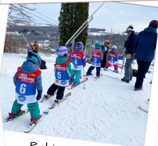
Robin's Race 2/20/22