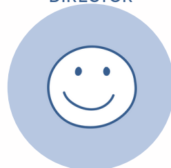
OPEN POSITION BOARD MEMBER

We are always looking for people to get involved and share ideas! Feel free to talk to any current board member or send an email to secretaryskiskan1@gmail.com .