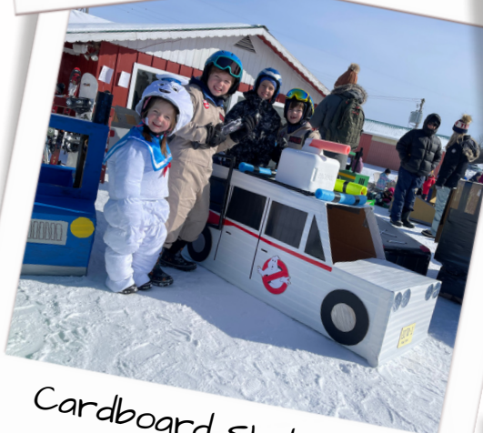
Cardboard Sled Race 1/29/22